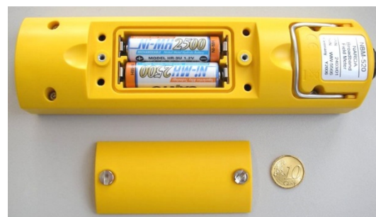
The battery compartment is opened easily using a coin. Two replaceable NiMH rechargeable batteries (AA size) are used to power the device.