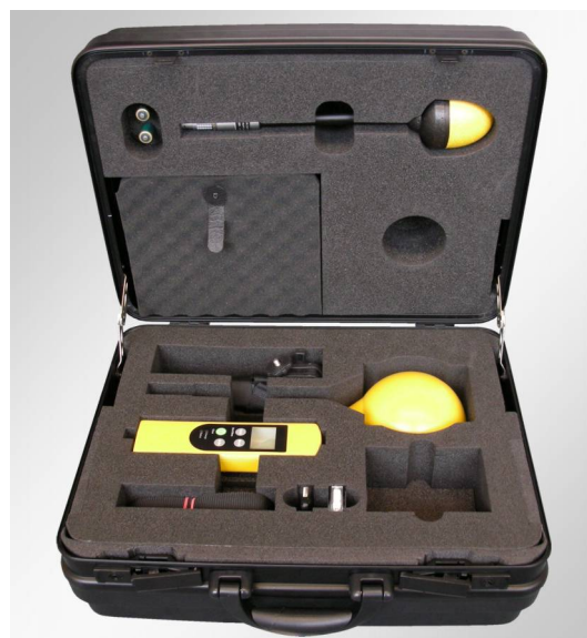
A rugged transport case is included. This provides ideal protection for the instrument, together with up to two probes and all accessories.