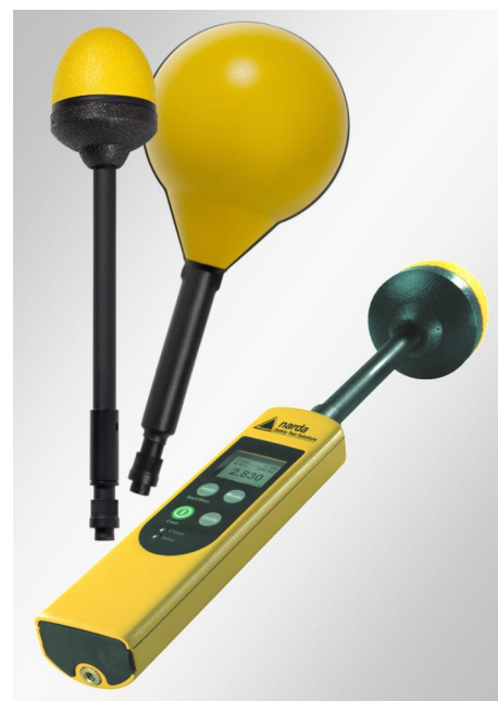
Changing the probe is quick and easy, with no need to reconfigure the device