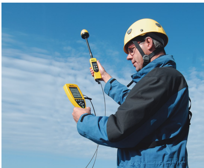
Probe extension using an optical cable: The NBM-550 acts as controller and displays the results. The smaller NBM-520 acts as the optical probe interface. Both devices can also be used separately as measuring devices when fitted with probes.