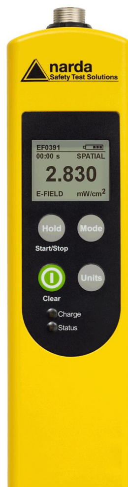
Narda Broadband Field Meter NBM-520

▲ Auto zero ensures precision measurements