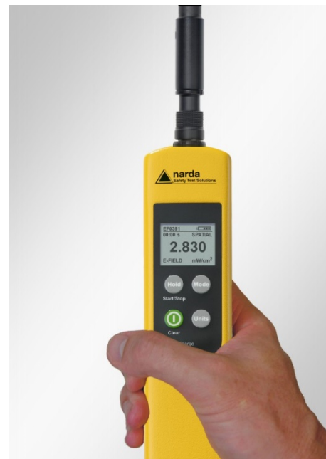
Small, lightweight and rugged design – ideal for use in rough environments